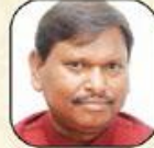
Chief Guest Shri. Arjun Munda Ji Hon'ble Minister, Ministry of Tribal Affairs, Govt. of India