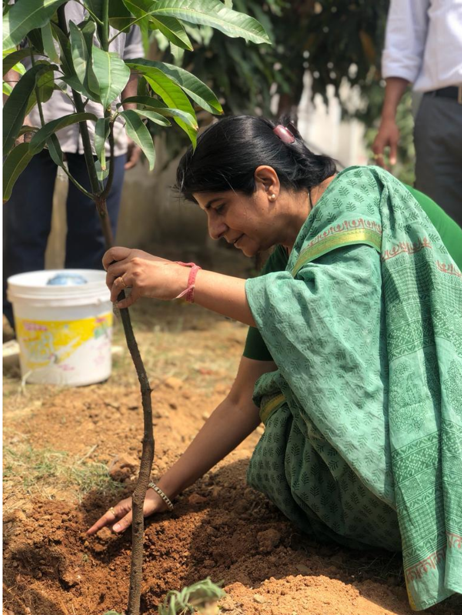
Two Photographs of the Event: