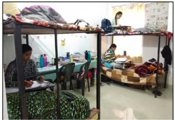
GIRLS HOSTEL ROOM