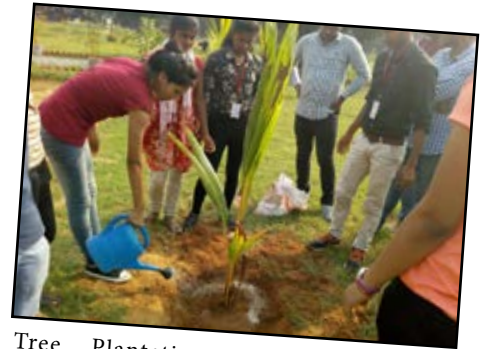
Tree Plantation in and around Namkum Campus by Students of Deptt. of Agriculture

Academic Block of Jharkhand Rai University at Raja Ulatu, Namkum, Ranchi. The construction of campus is in full swing. Ground and first floor of academic block is functional with computer lab, Library, labs classroom for the student.