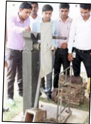
Engg. students working on the machines placed at Namkum Campus.