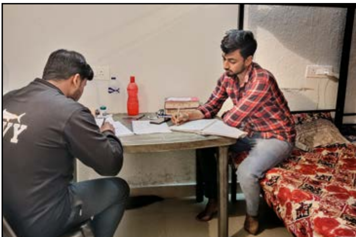
BOYS HOSTEL ROOM

The University provides hostel facility for both boys and girls. Presently it is capable of serving about 96 boys & 96 girls inside the campus in apartments, ensuring best social life and security for students. The hostel rooms are equipped with 24 hours of power back up and security.