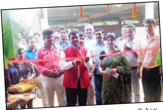
Hon'ble MLA Shri. Ram Kumar Pahan inaugurating the new labs & workshops at the Namkum Campus.

The University provides safe and secure hostel facility to students. The hostel block is built over 50,000 sq. ft area. There are separate hostel facilities for boys and girls. Daily bus services are provided to and from campus making it easier for students to commute.